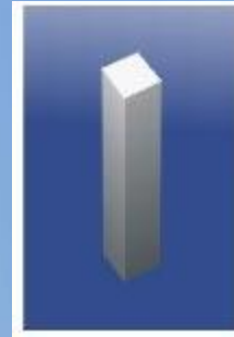
Squares: 5mm upto 75mm