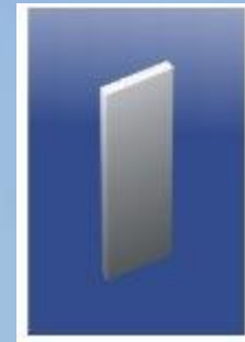
Flats: 5-upto 25mm thickness X 100mm width.