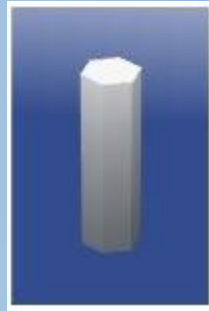
Hexagonal: 10mm upto 75mm A/F