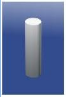
Rounds: 2.5mm upto 100mm